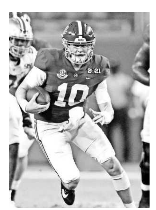
Alabama's Mac Jones had nine TD passes with just 14 incompletions in two CFP games.